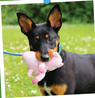
Support homeless pets