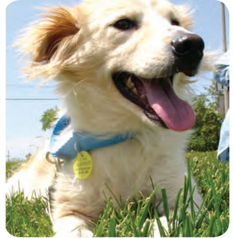
Taffy was brought to WHS with heartworms; fortunately, she was successfully treated by WHS veterinary staff.

Because a life-threatening reaction can occur if this medication is administered to an infected pet, a simple blood test is recommended before beginning a prevention program to confirm that your pet