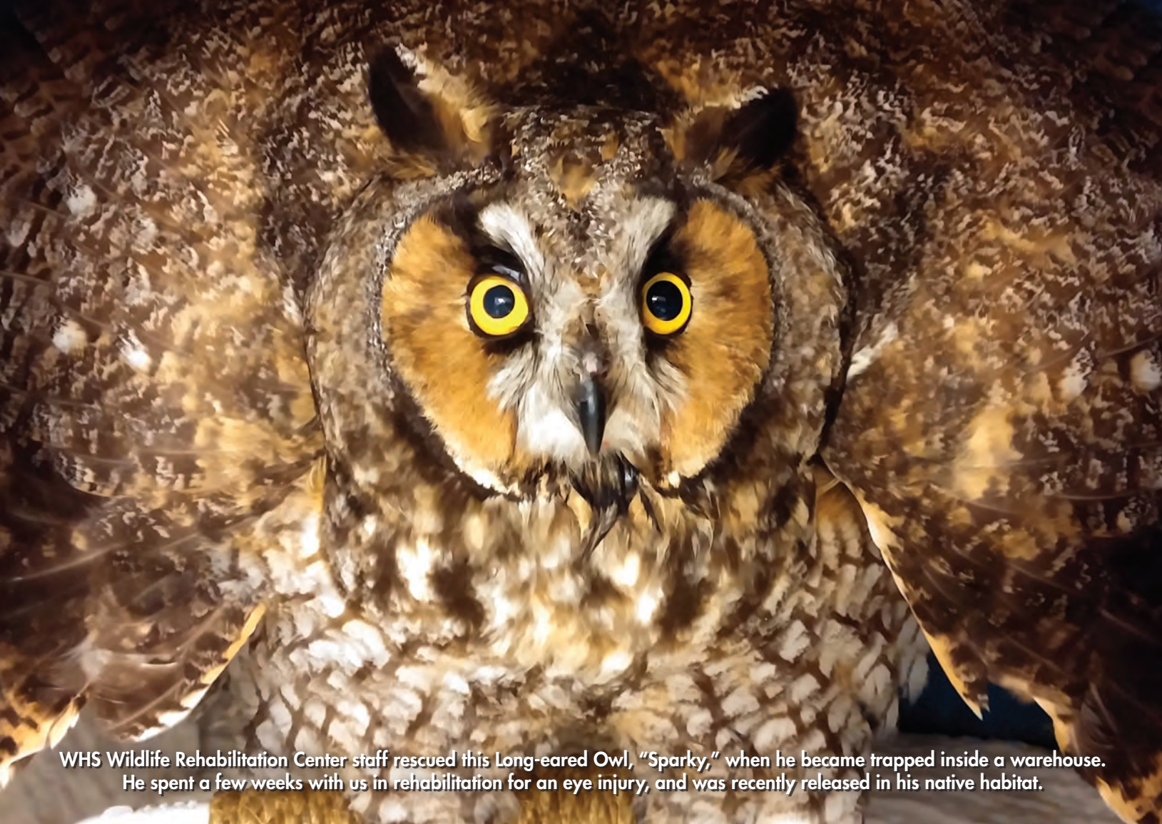
WHS Wildlife Rehabilitation Center staff rescued this Long-eared Owl, "Sparky," when he became trapped inside a warehouse. He spent a few weeks with us in rehabilitation for an eye injury, and was recently released in his native habitat.