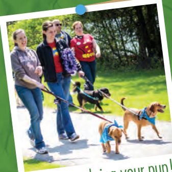
Go solo or bring your pup!