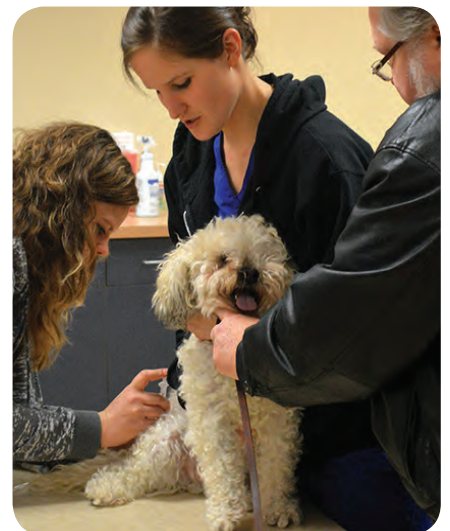
The bordetella vaccine is just $20 at our vaccine clinics, held regularly at our Milwaukee and Racine Campuses.

There are bordetella vaccines available for dogs which can lessen the severity of disease and can even prevent infection altogether. This vaccine is an optional vaccine, not a core vaccine. Your veterinarian can help you determine whether this vaccine is appropriate for your dog.